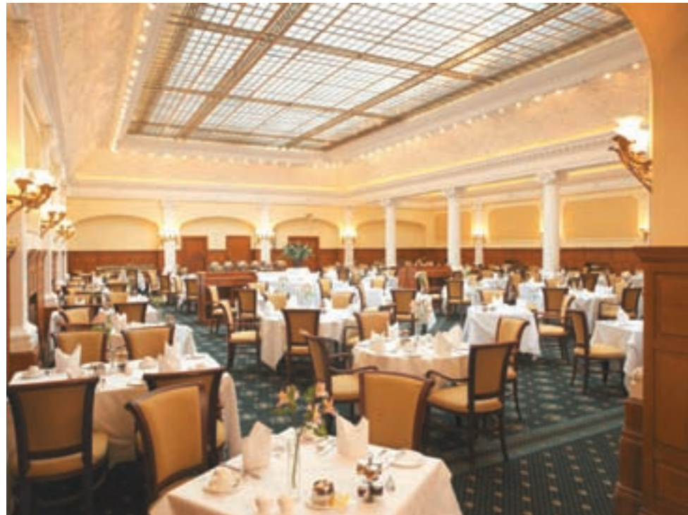
The Wedgwood Restaurant

20.00 Annual Dinner in The Wedgwood Restaurant