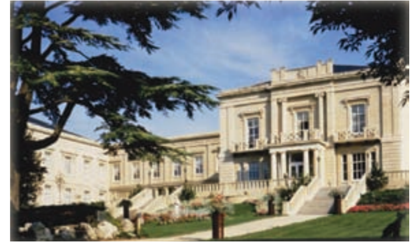
2004 Bath Spa, Bath