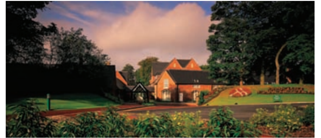
2001 Marriott Worsley, Manchester