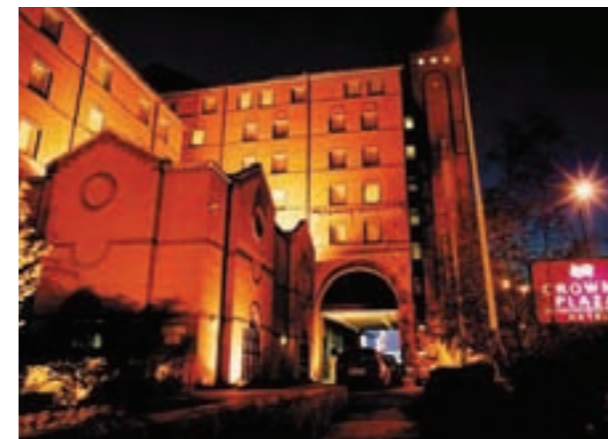
2000 Crowne Plaza, Leeds