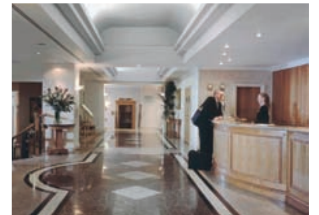
1999 Renaissance, Manchester