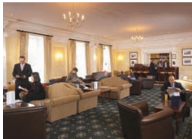
The Swan Lounge