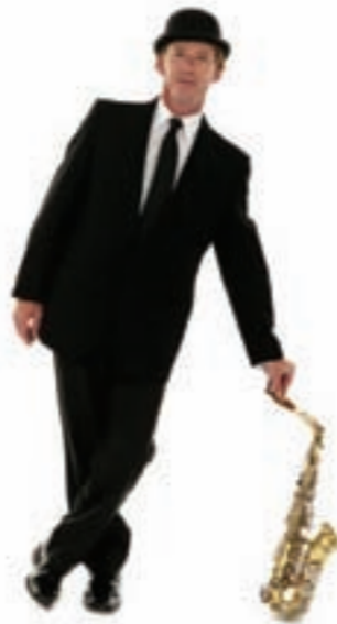
Entertainment by Matt Stacey