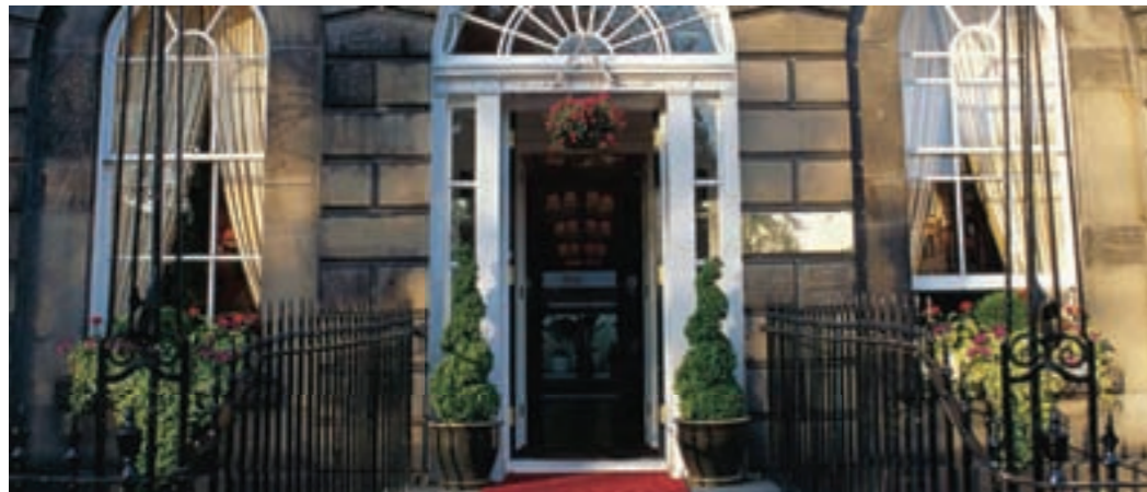
2006 The Roxburghe, Edinburgh