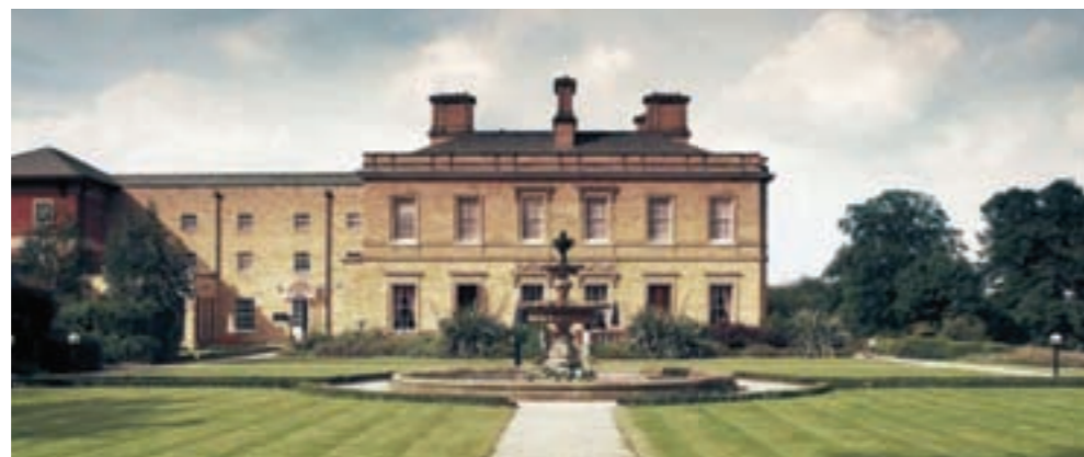
2005 Oulton Hall, Leeds