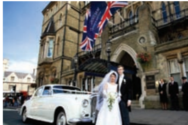
2007 The Randolph, Oxford