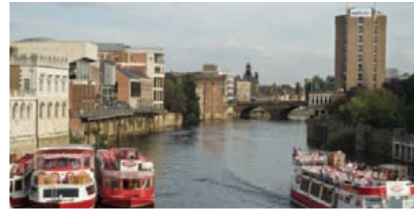
2003 / 2002 Moathouse Park Inn, York